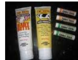
Gel, Ointment, Lotion, Cream