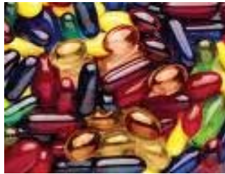
Soft Gel Capsule